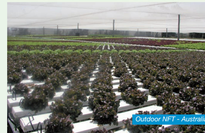
Outdoor NFT - Australia