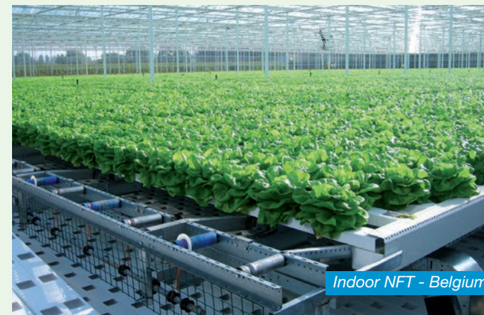
Indoor NFT - Belgium