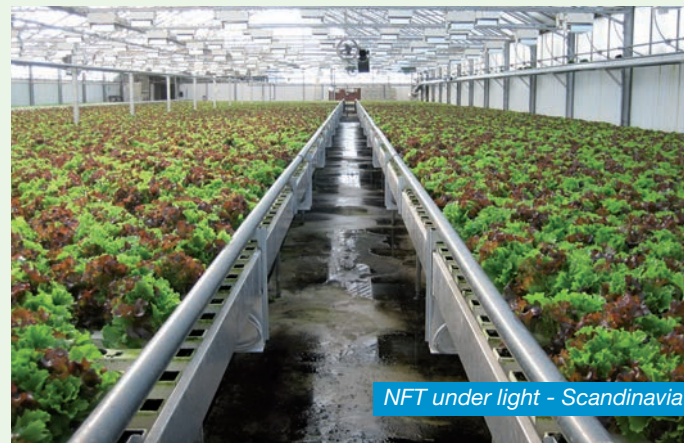
NFT under light - Scandinavia