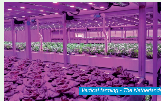
Vertical farming - The Netherlands