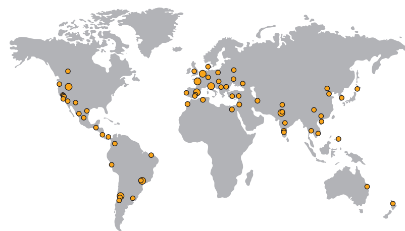
Vegetable Seeds presence worldwide

Under the Nunhems brand we deliver a wide range of lettuce varieties for outdoor, glasshouse and hydroponic cultivation and we are always working on breeding and selecting new varieties.