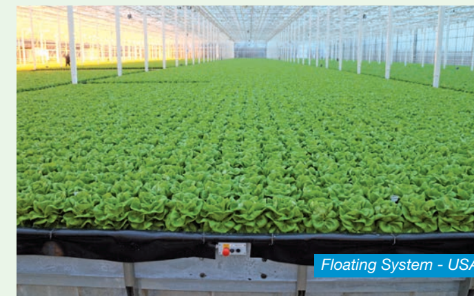
Floating System - USA

Fresher colors and a longer harvest window with Nunhems multicolor mixes