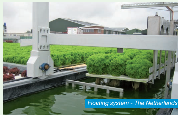
Floating system - The Netherlands